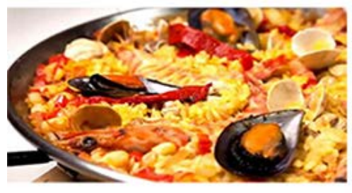
>>FOOD Tapas Food