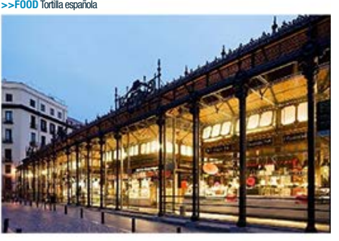
>>FOOD Wonderful Market in the center of Madrid