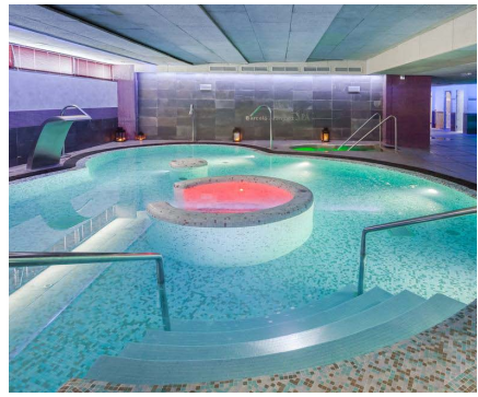
>>OCCIDENTAL HOTEL Spa area