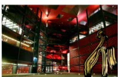
>>MADRID Reina Sofia Museum