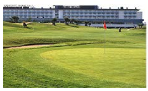
>>ARANJUEZ View of the Golf Course