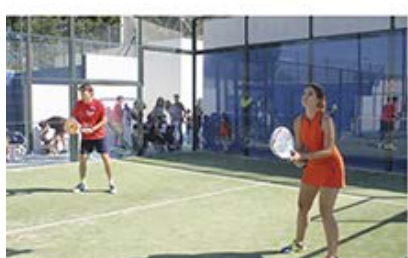
>>OCCIDENTAL HOTEL Padel Court