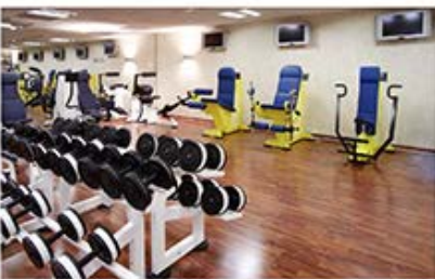
>>OCCIDENTAL HOTEL Gym