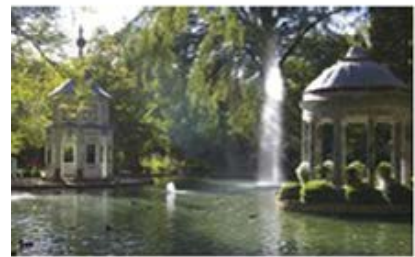
>>ARANJUEZ Royal Palace Gardens