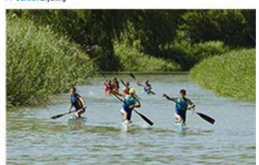
>>ARANJUEZ Kayaking on the river