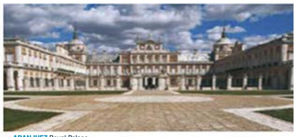
>>ARANJUEZ Royal Palace