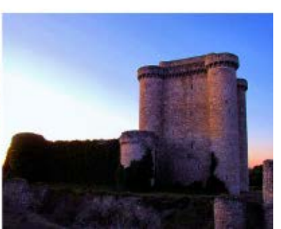
>>SESEÑA Castle Puñoenrostro