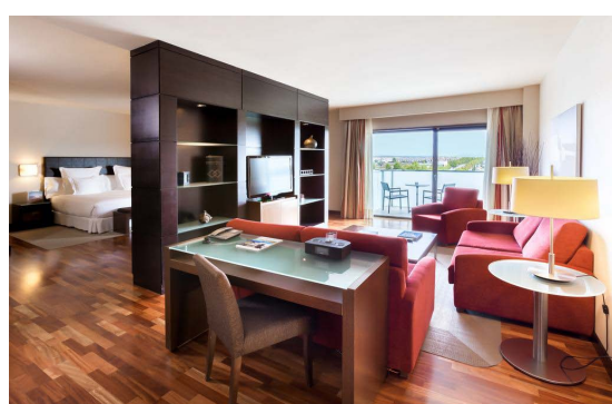
>>OCCIDENTAL HOTEL Bedroom